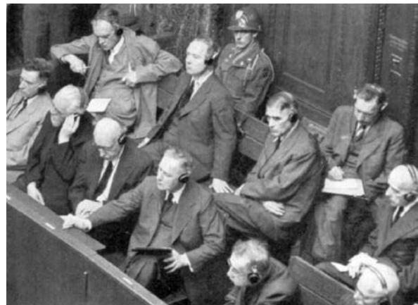
ELEVEN PRINCIPAL DEFENDANTS IN I. G. FARBEN TRIAL

With Von Schnitzler's confessions of guilt considered of doubtful