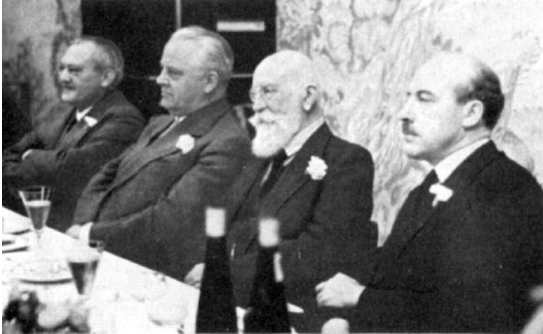
A picture taken in the early 1030's showing from left to right: Dr. Carl Bosch, second head of Farben (succeeding Duisberg and preceding Hermann Schmitz); Defendant Hermann Schmitz; an unidentified person and Defendant Georg von Schnitzler.